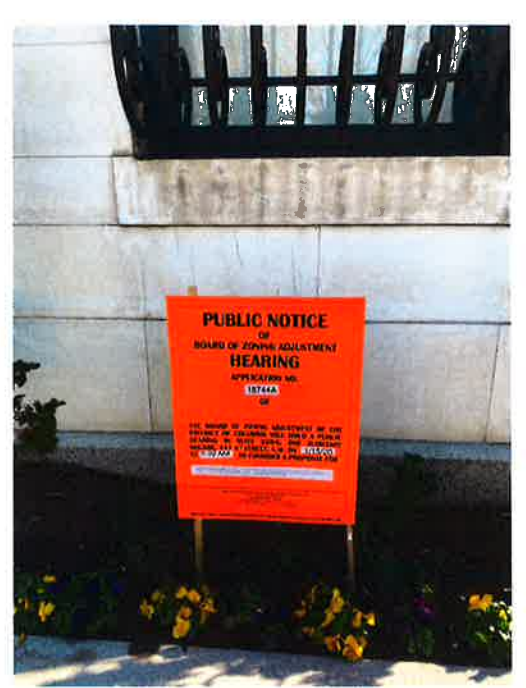
1/6/20 Dupont Circle NW