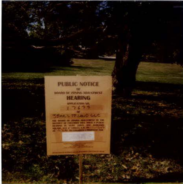
BZA 17679 6916 Willow Street NW 11/7/07