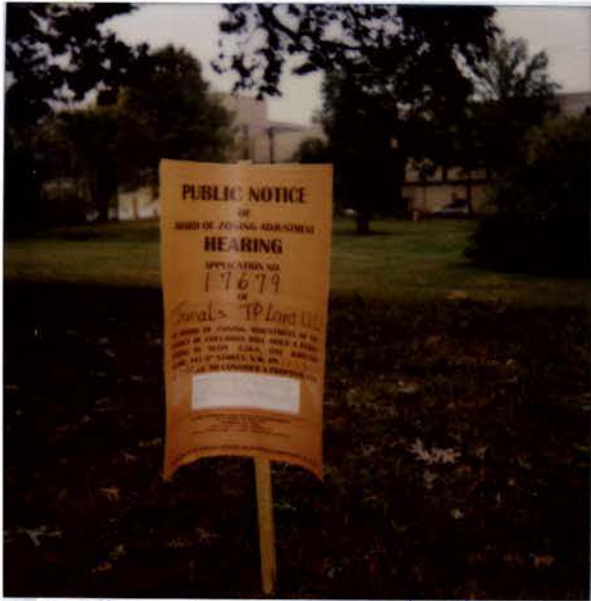
BZA 17679 10/31/07 6923 Maple Street N.W.

BZA 17679 Application of Jenal's TP Land LLC