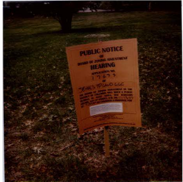
6916-6918 Willow Street NW BZA 17679 11/7/07