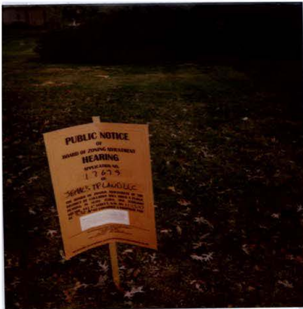
6923-6953 Maple Street NW BZA 17679 11/12/07