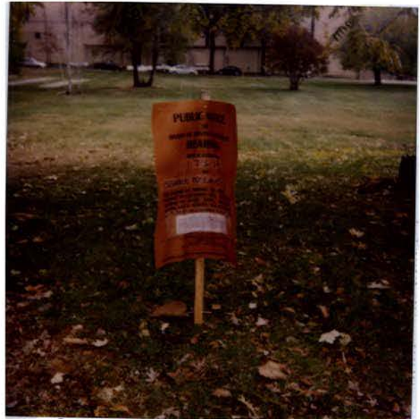
BZA 17679 11/7/07 6923-6953 Maple Street N.W.