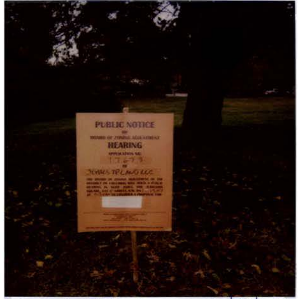
BZA 17679 10/31/07 6916 Willow Street N.W.