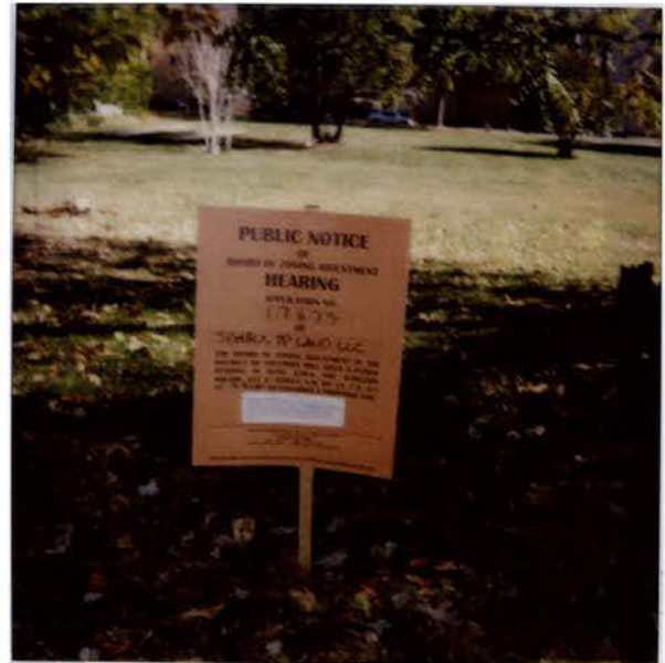
6923-6953 Maple Street NW BZA 17679 11/12/07