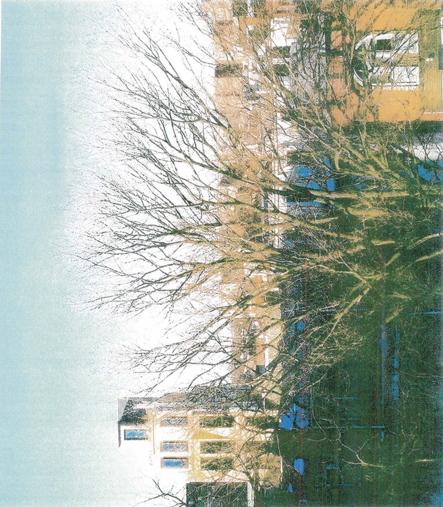
1819 Belmont Road viewed from Kalorama Road, 1 block south