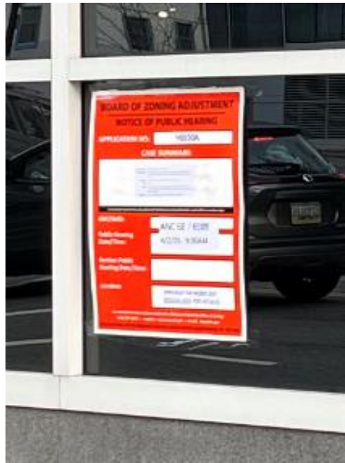
2. 3/17/25 – E Street NW