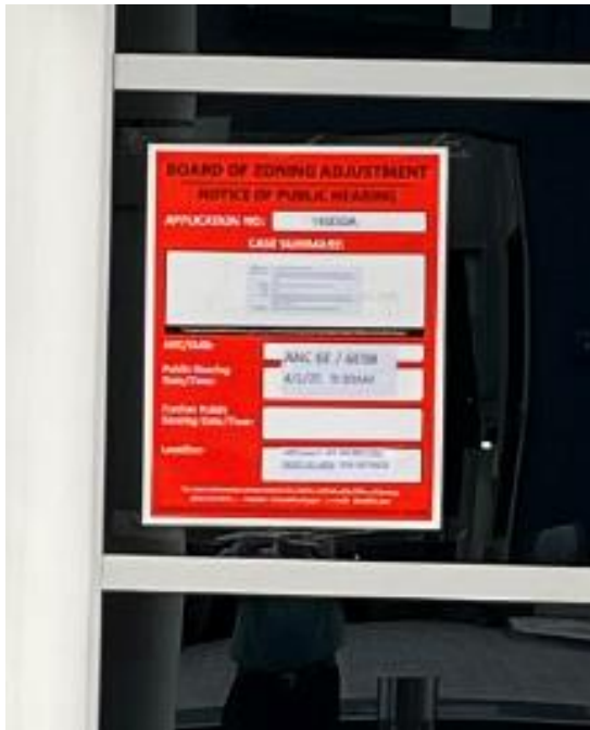
1. 3/17/25 – New Jersey Ave NW