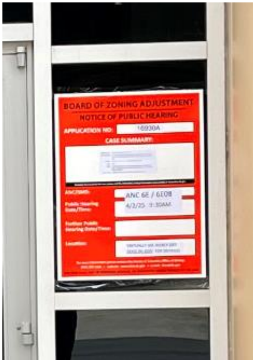
3. 3/17/25 – 1st Street NW