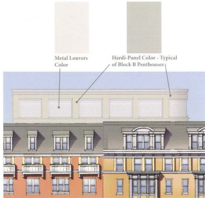
Partial South Elevation - Typical Penthouse Treatment - Block B