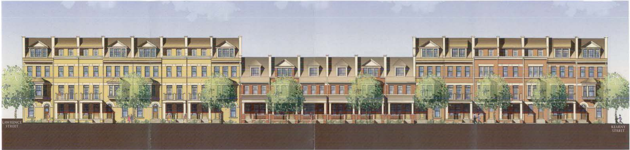
West Elevation - Kearny Street NE