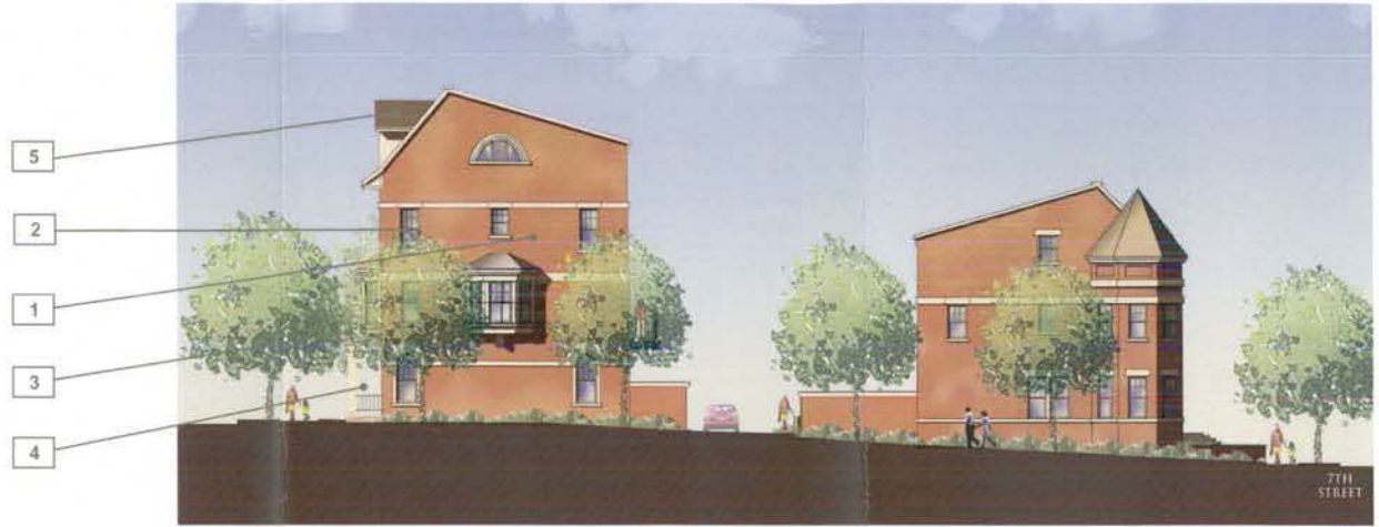
South Elevation - Kearny Street NE