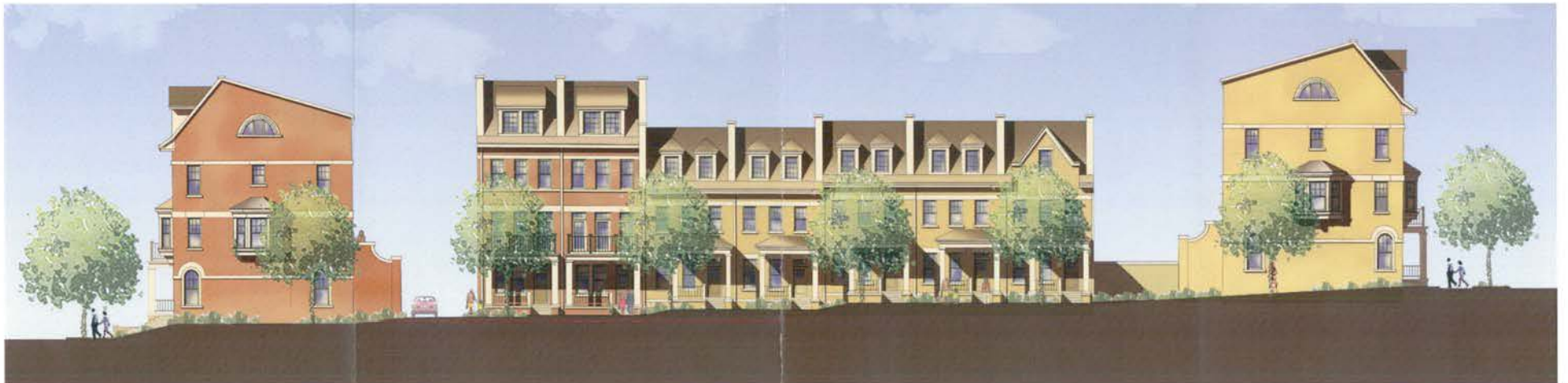
North Elevation - Lawrence Street NE

Note - Utility poles and lines not shown for graphic purposes. Although applicant is not completing the undergrounding of utilities, applicant is committed to coordinating with and allowing relevant utility companies and District government agencies to complete undergrounding.