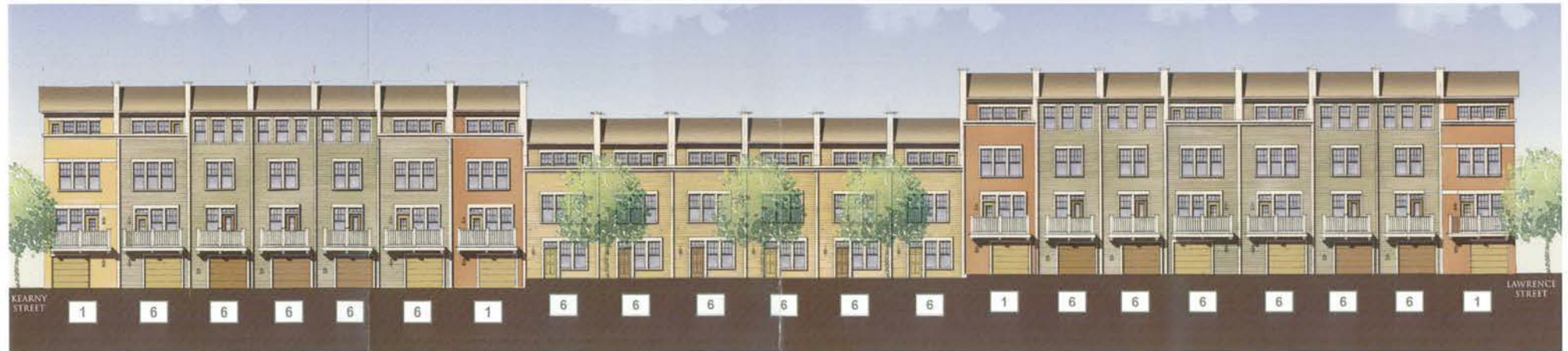
West Alley Elevation (Rear of Kearny St. Elevation)

©2009 Torti Gallas and Partners, Inc. | 1001 Spring Street, 10th Floor, Silver Spring, Maryland 20910-3018, also