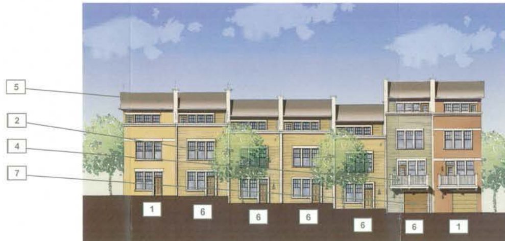
North Alley Elevation (Rear of Lawrence St. Elevation)

(Using Torti Gallas and Partners, Inc. | 1200 Spring Street, 4th Floor, Silver Spring, Maryland | 301-588-1000)