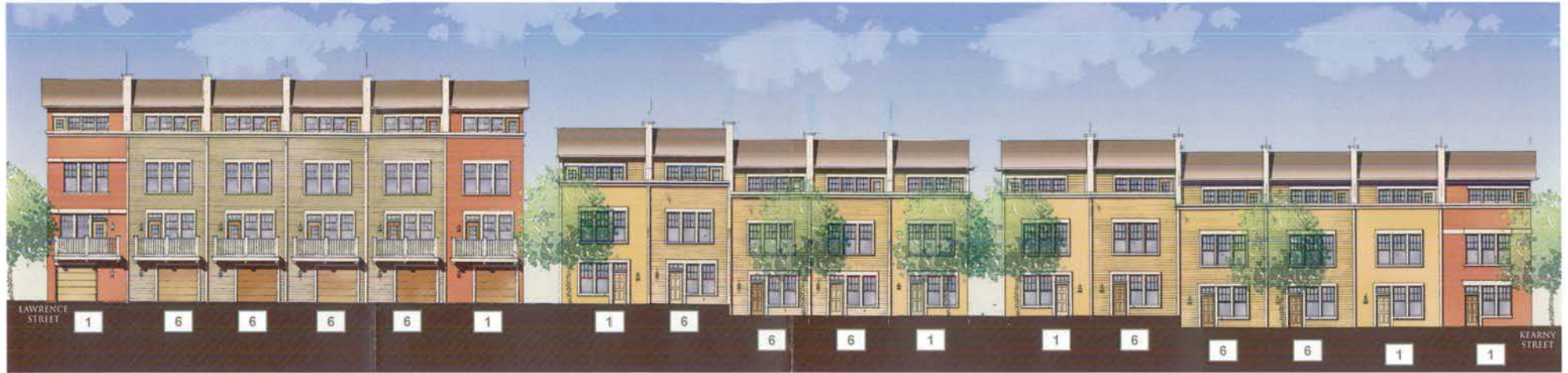
East Alley Elevation (Rear of 7th St. Elevation)