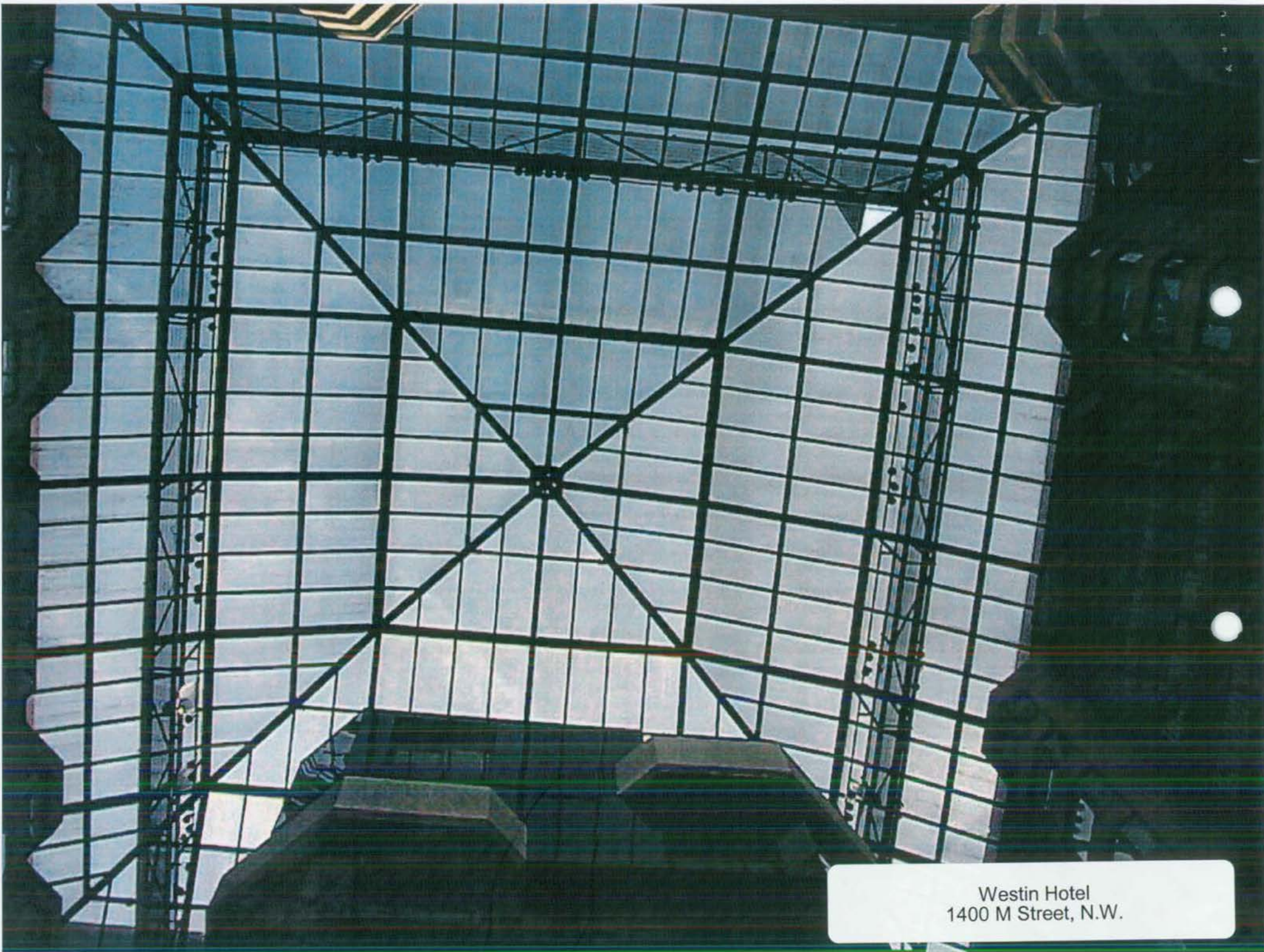
Westin Hotel 1400 M Street, N.W.