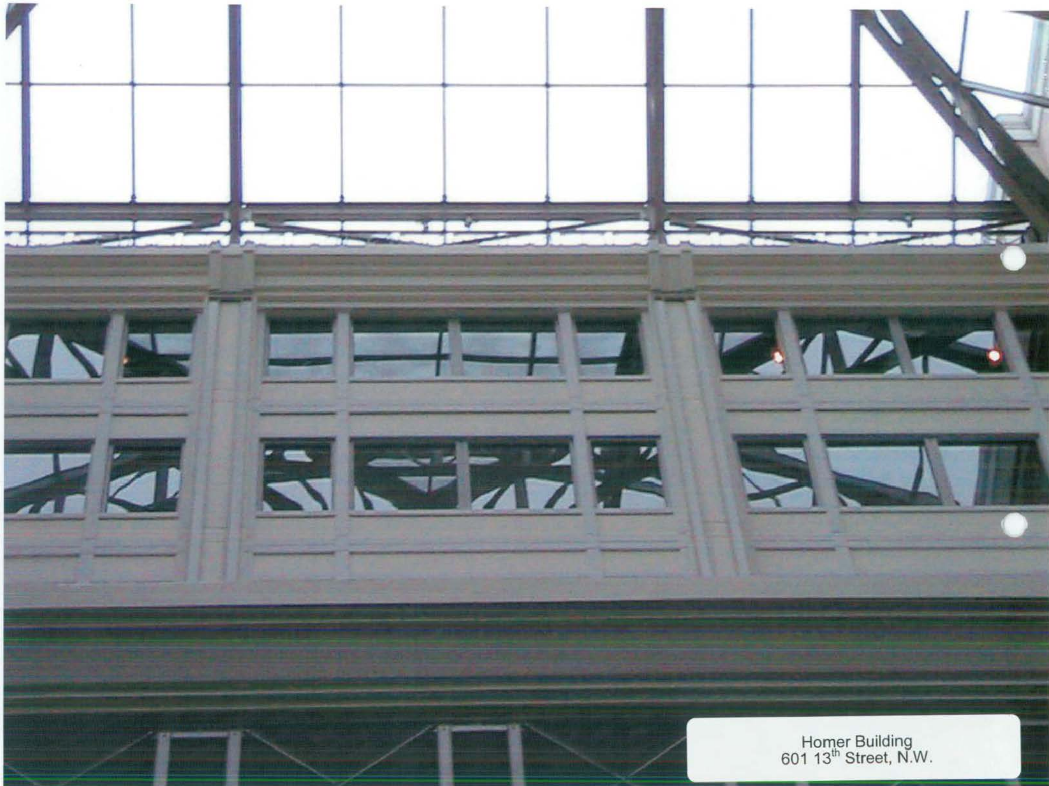
Homer Building 601 13 th Street, N.W.