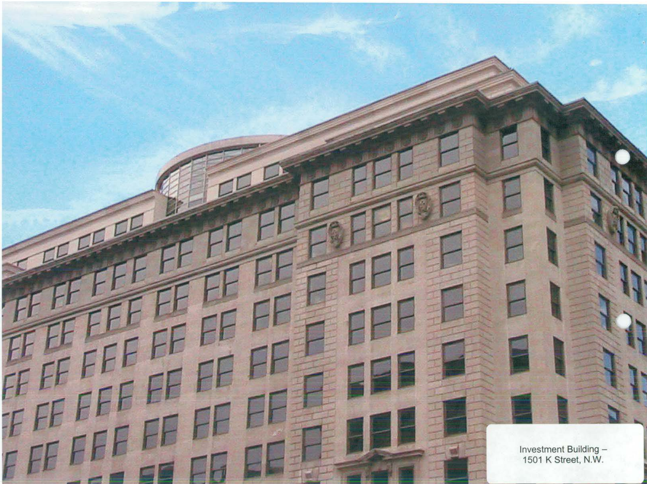
Investment Building – 1501 K Street, N.W.