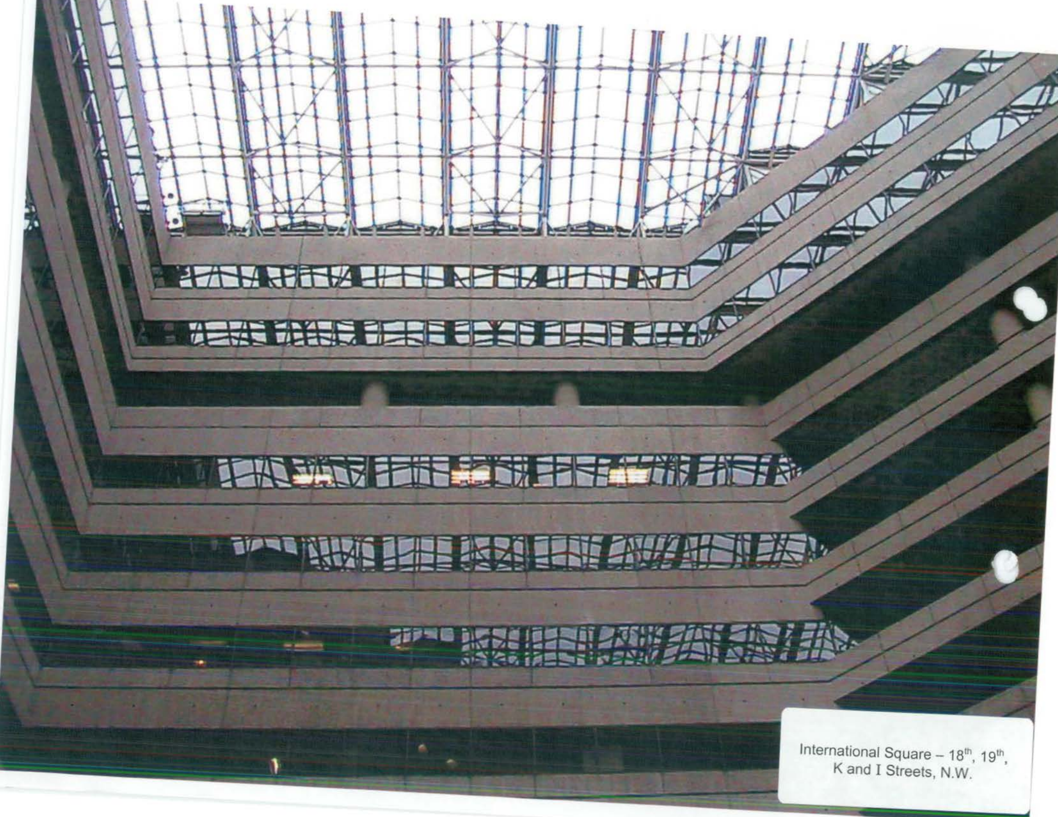
International Square – 18 th , 19 th , K and I Streets, N.W.