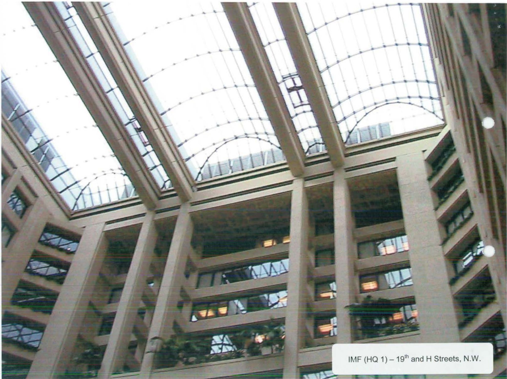
IMF (HQ 1) – 19 th and H Streets, N.W.