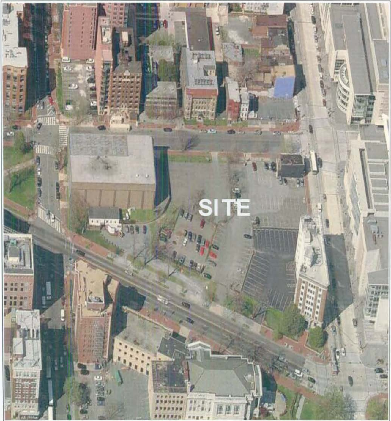
Figure 2 Aerial Photograph of Proposed Marriott Marquis Hotel Site