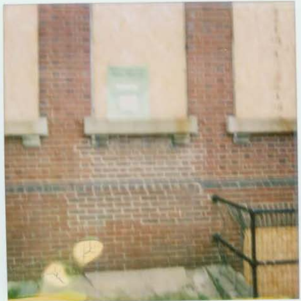
ZC 07-13 September 14, 2007

RECEIVED D.C. OFFICE OF ZONING 2007 SEP 26 PM 12:25