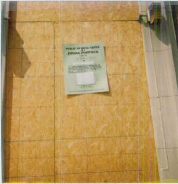
ZC 07-13 I Street Entrance September 7, 2007

ZC 07-13 PUD and Related Map Amendment at square 6435 Lot 80 Trustees of the Georgetown Gallery of Art and m R. Randall School