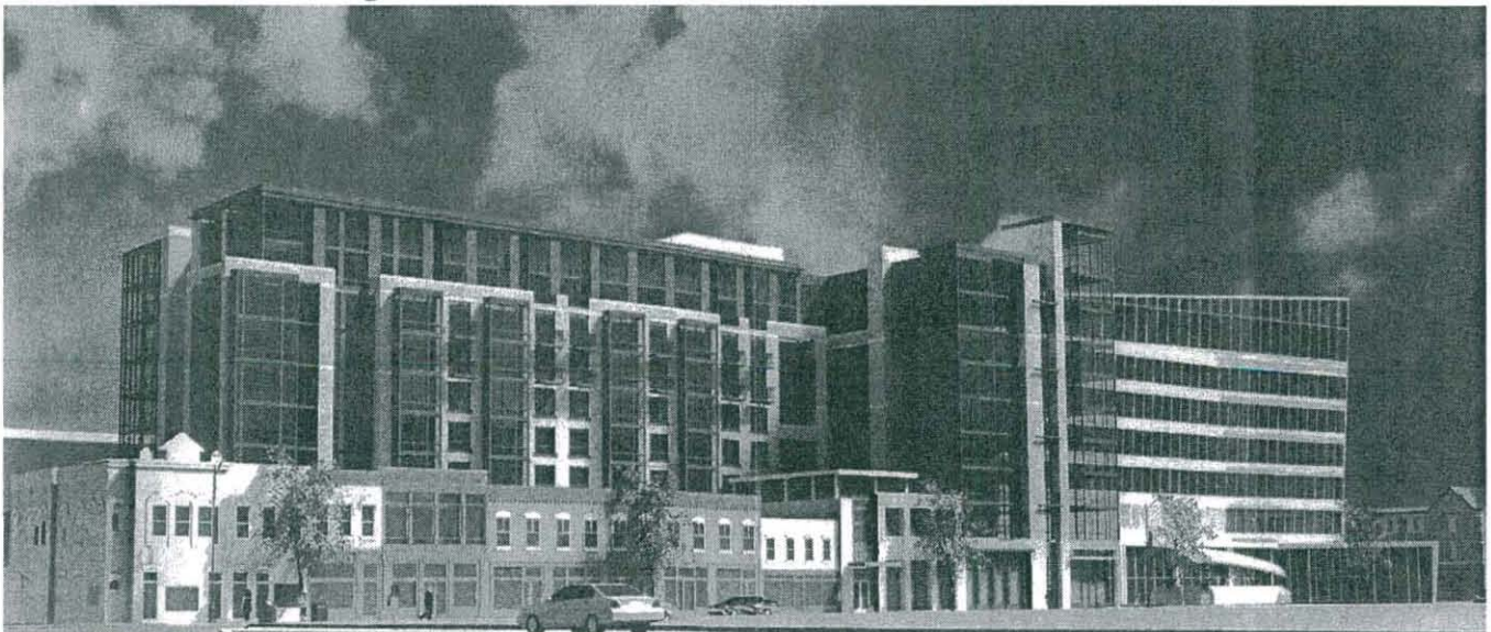
Rendered View of 7 th and T Streets, NW

The applicant, Broadcast Center Partners, LLC, proposes to construct a mixed-use development with a 9-story brick masonry residential structure (192,511 SF with 180 apartments) on the northern portion of the site and a seven-story glass and steel office structure (103,083 SF) to the south. Although residential and office roof lines are shown as level below the parapet, because they are measured from different elevations at grade, their heights vary: 90 feet for the residential portion measured from T Street, 96.5 feet for the office space measured from S Street, (both at top of roof below the parapet), a tower rising to 105 feet on 7 th Street, and an architecturally-embellished cornice rising to 111' measured from S Street for the office. Existing historic structures will be incorporated into the northern portion of the building and contain ground floor retail uses. There would be 2 levels of underground parking with 177 spaces, of which 29 would be tandem. Parking and loading would be accessed through the eastern alley. Overall development would have an FAR of 6.3, of which 2.5 would be non-residential, with 88% lot occupancy. The applicant has requested a related zoning map amendment from ARTS/C-2-B to ARTS.C-2-C, allowing an FAR of 6.0, with 2.5 not residential.