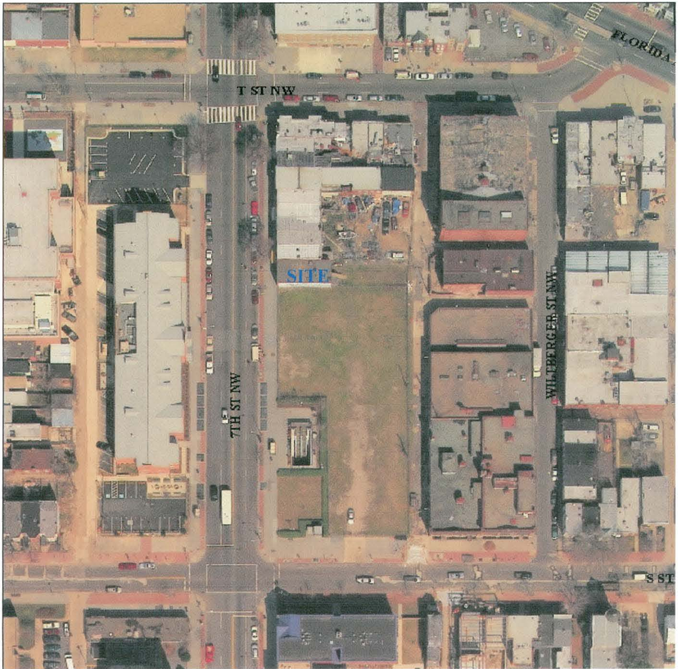
Figure 1: Aerial View