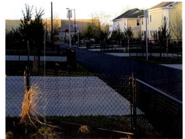
SAMPLE ILLUSTRATION OF 3' LOW FENCE

©2006 Torti Gallas and Partners, Inc. | 1000 Spring Street, 4th Floor, Silver Spring, Maryland 20910-3034 410.490.4100