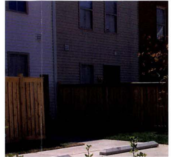
SAMPLE ILLUSTRATION OF 6' PRIVACY FENCE