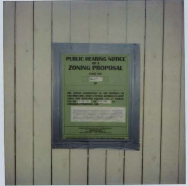
2 PENNSYLVANIA AVE 10-5-06