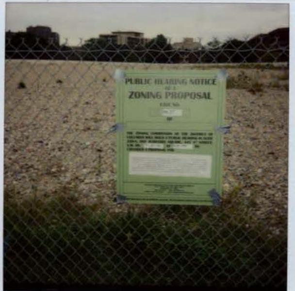
4 I STREET 10-5-06