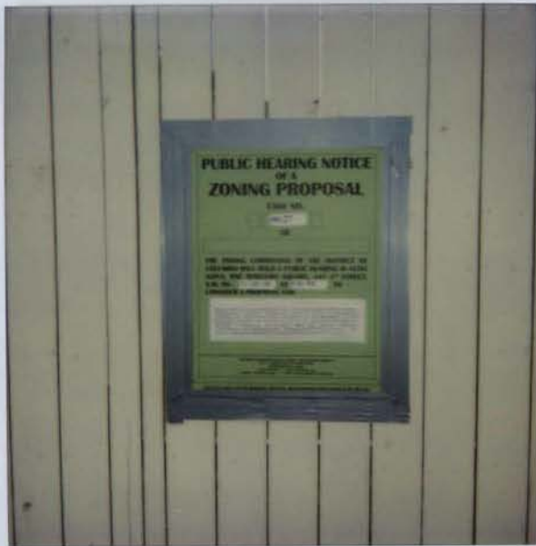
1 WASHINGTON CIRCLE 10-5-06