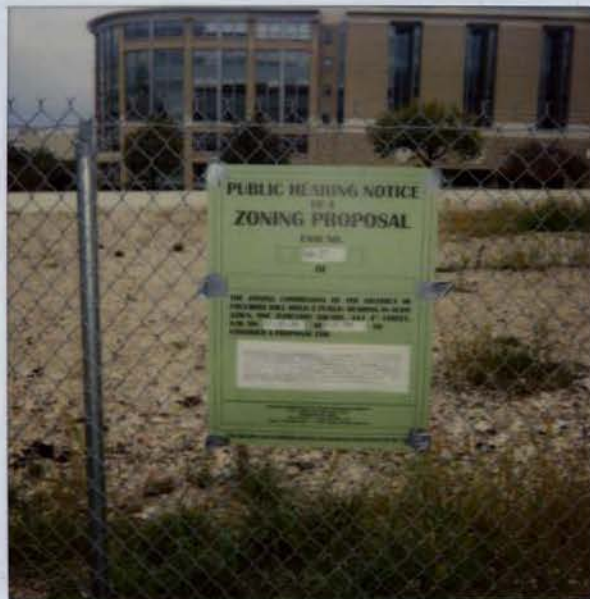
3 22 ND STREET 10-5-06