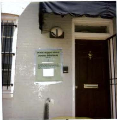
700 Block of 2nd St NE 2C 05-37