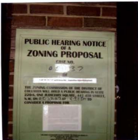
210 6 St NE 2C 05-37