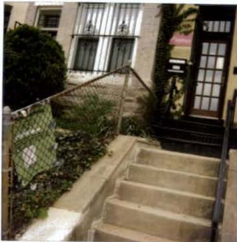
700 Block of 2nd St NE 2C 05-37