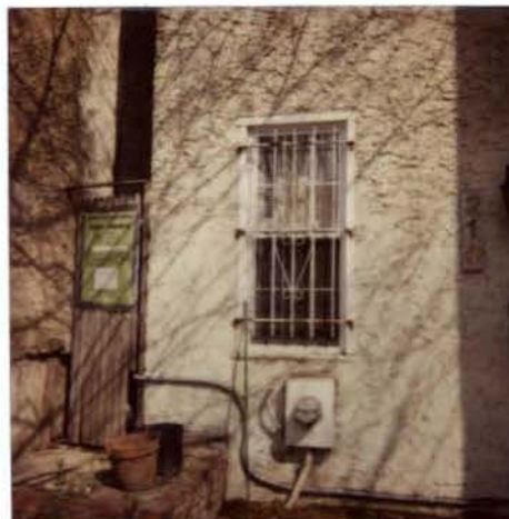
214 6 St NE