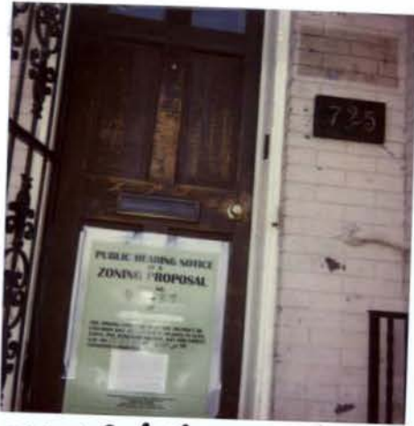
725 2nd St NE 2C 05-37