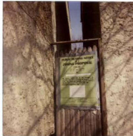
200 Block of 6th St NE 2C 05-37