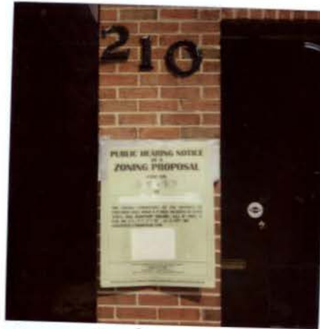
2106 5th St NE 2C 05-37