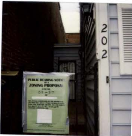
2C 05-37 202 6th St NE