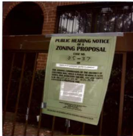
200 Block of 6 Street NE 2C 05-37