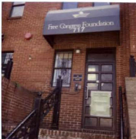
717 2nd St NE 2C 05-37