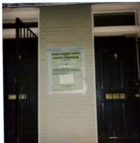
700 Block of 2nd St NE 2C 05-37