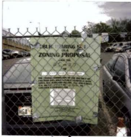
700 Block of 2nd St NE