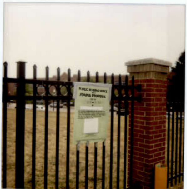
2C 05-23A ECKINGTON PLACE NE