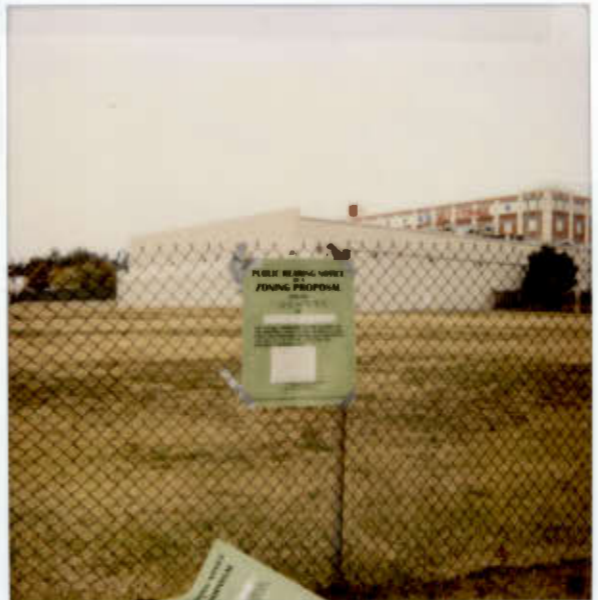
2C 05-23A HARRY HANCOCK WAY NE