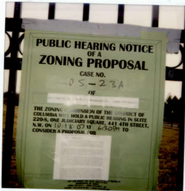
2C 05-23A ECKINGTON PLACE NE

2C 05-23A Application of Nova West Residential LLC - Square 3576, Lot 815