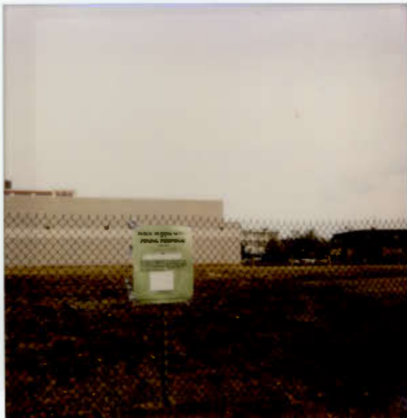
2C 05-23A HARRY HANCOCK WAY NE