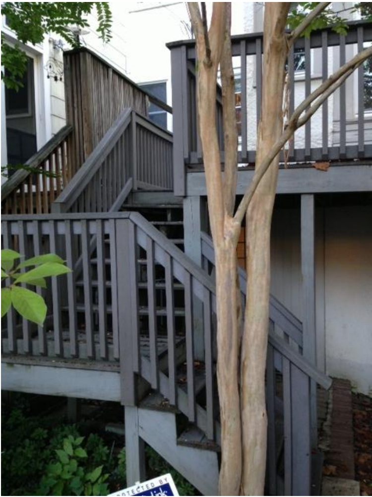
Stairs leading down from old deck