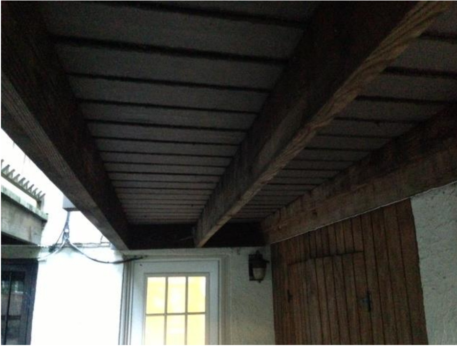
Underside of Old Deck, Showing our basement door and our adjacent neighbor's basement door