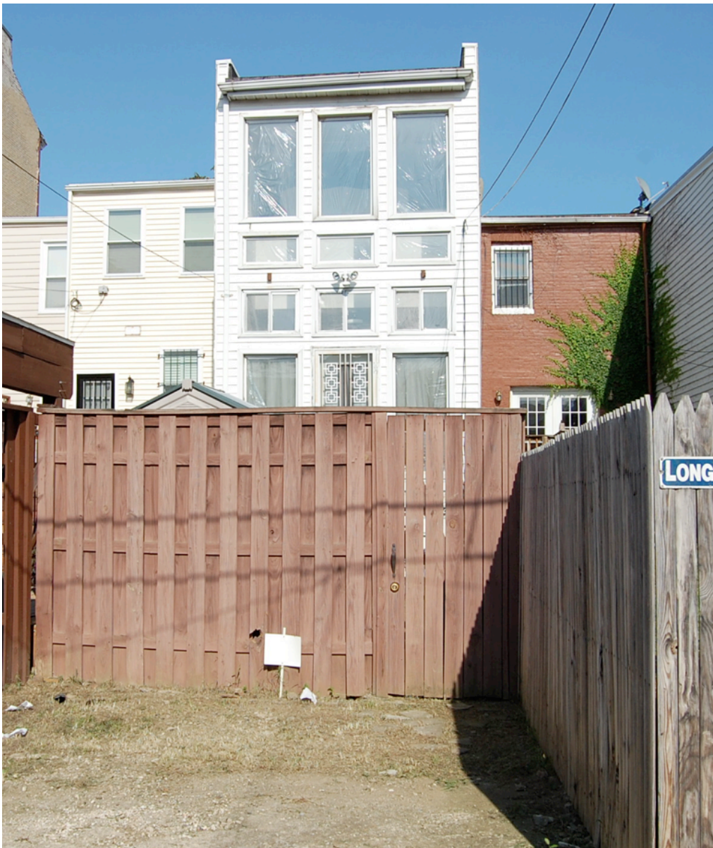
Photo of existing parking pad and fence at 1548.

At the rear of the property there is a 10-foot-wide alley lined by garages, carports and fences. Comparison between the old and new facades shows little difference in the impact of the design. The pattern of openings, of the façade, the massing and the inclusion of porches and landings is consistent with other buildings in the area.