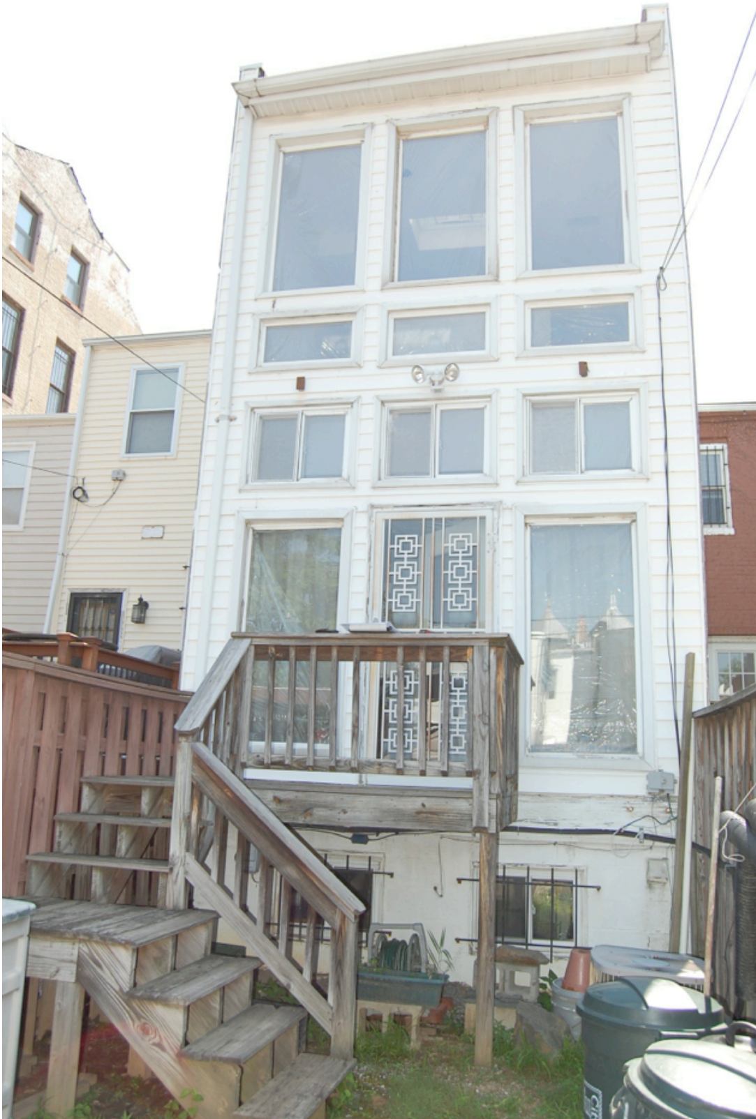
Existing conditions showing access steps and deck.