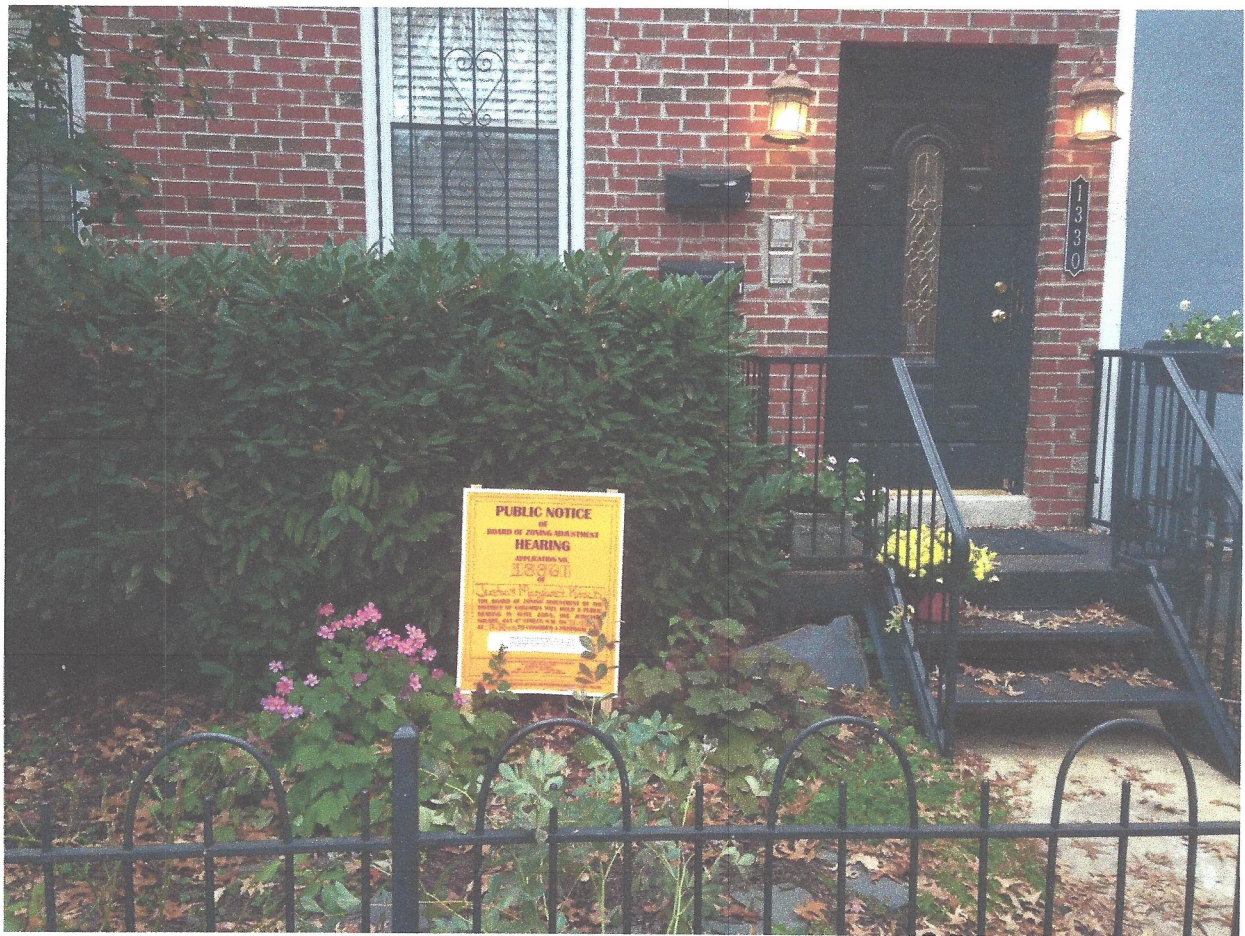
Photograph No. 1: 5 th Street Frontage/Front of House