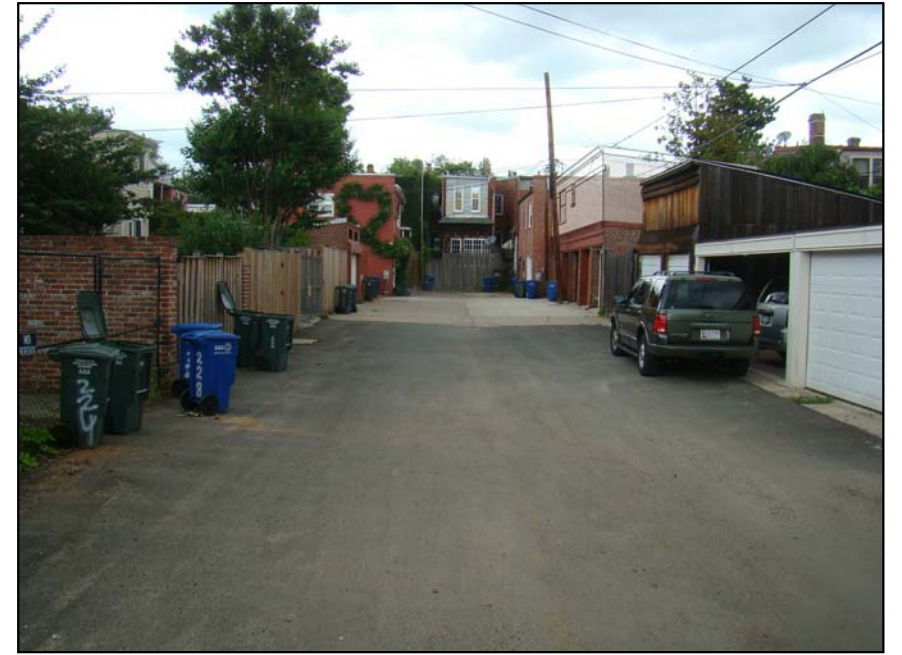
EXISTING VIEW FROM ALLEY W/ PROPOSED SECOND FLR. GARAGE RENOVATION