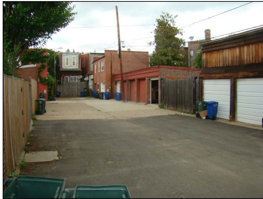
EXISTING VIEW FROM BACK ALLEY