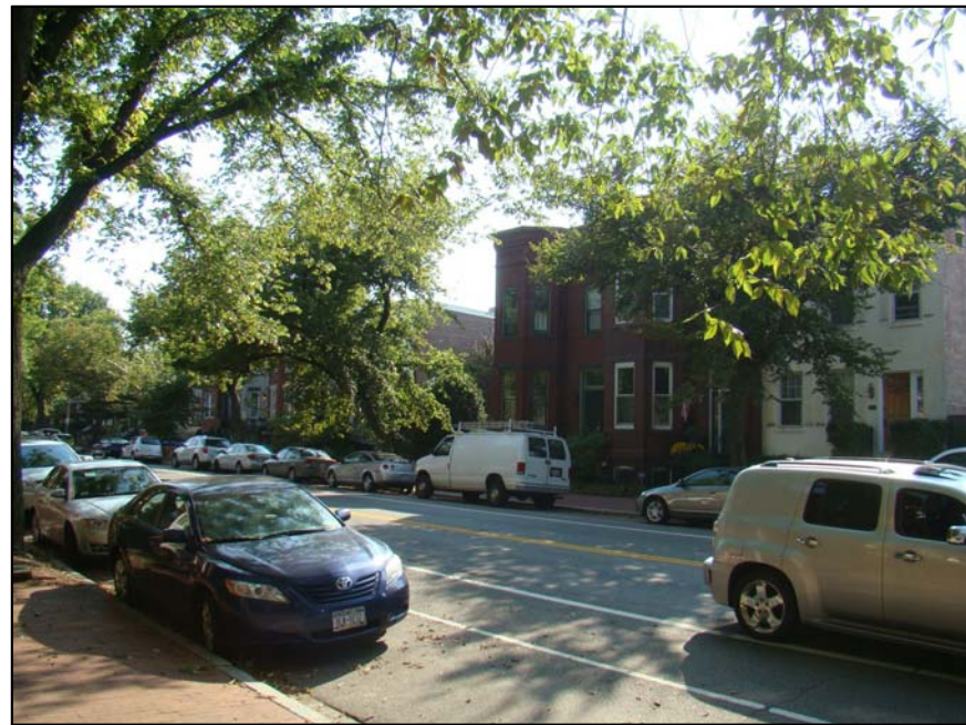
EXISTING VIEW FROM 11TH. STREET