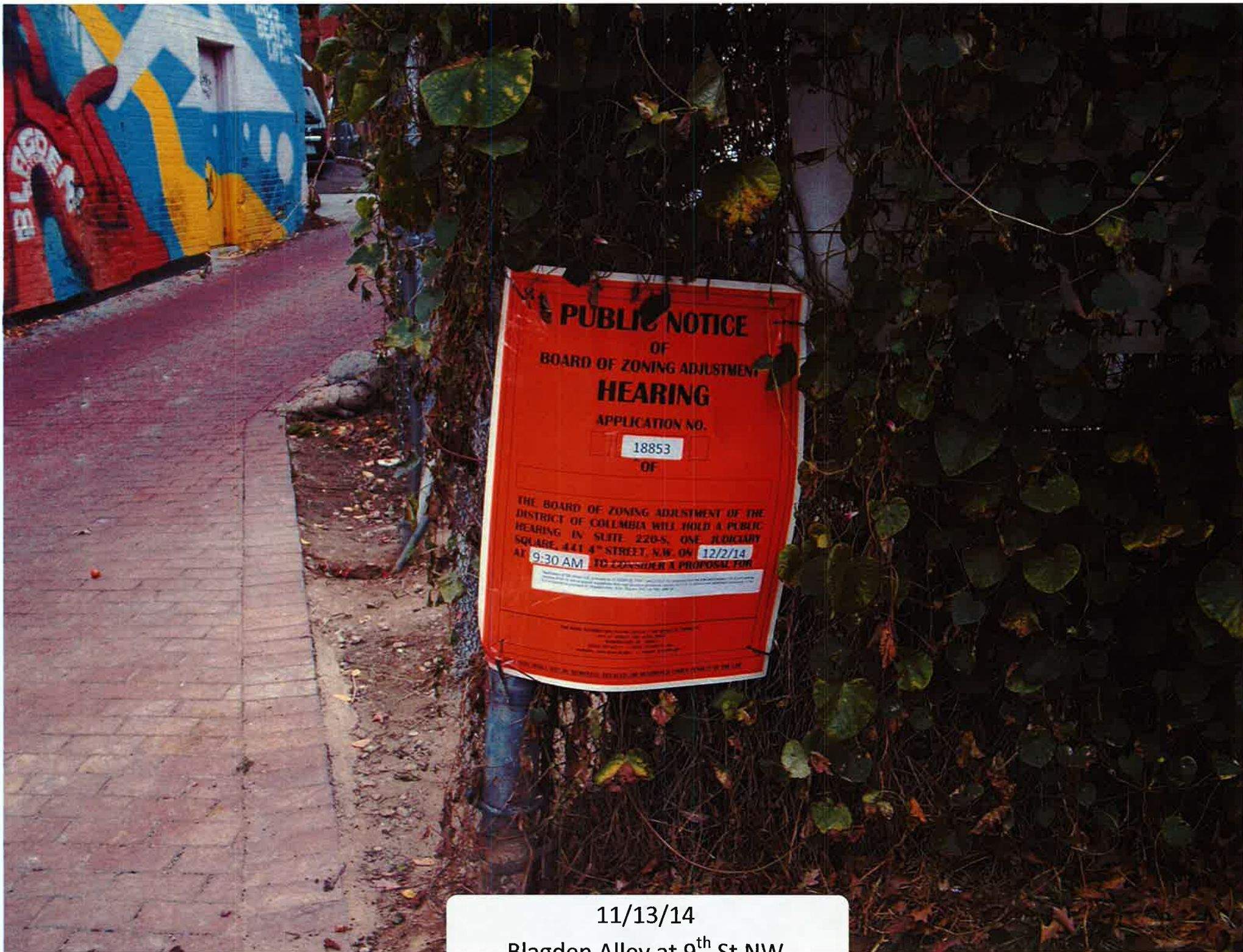
11/13/14 Blagden Alley at 9 th St NW