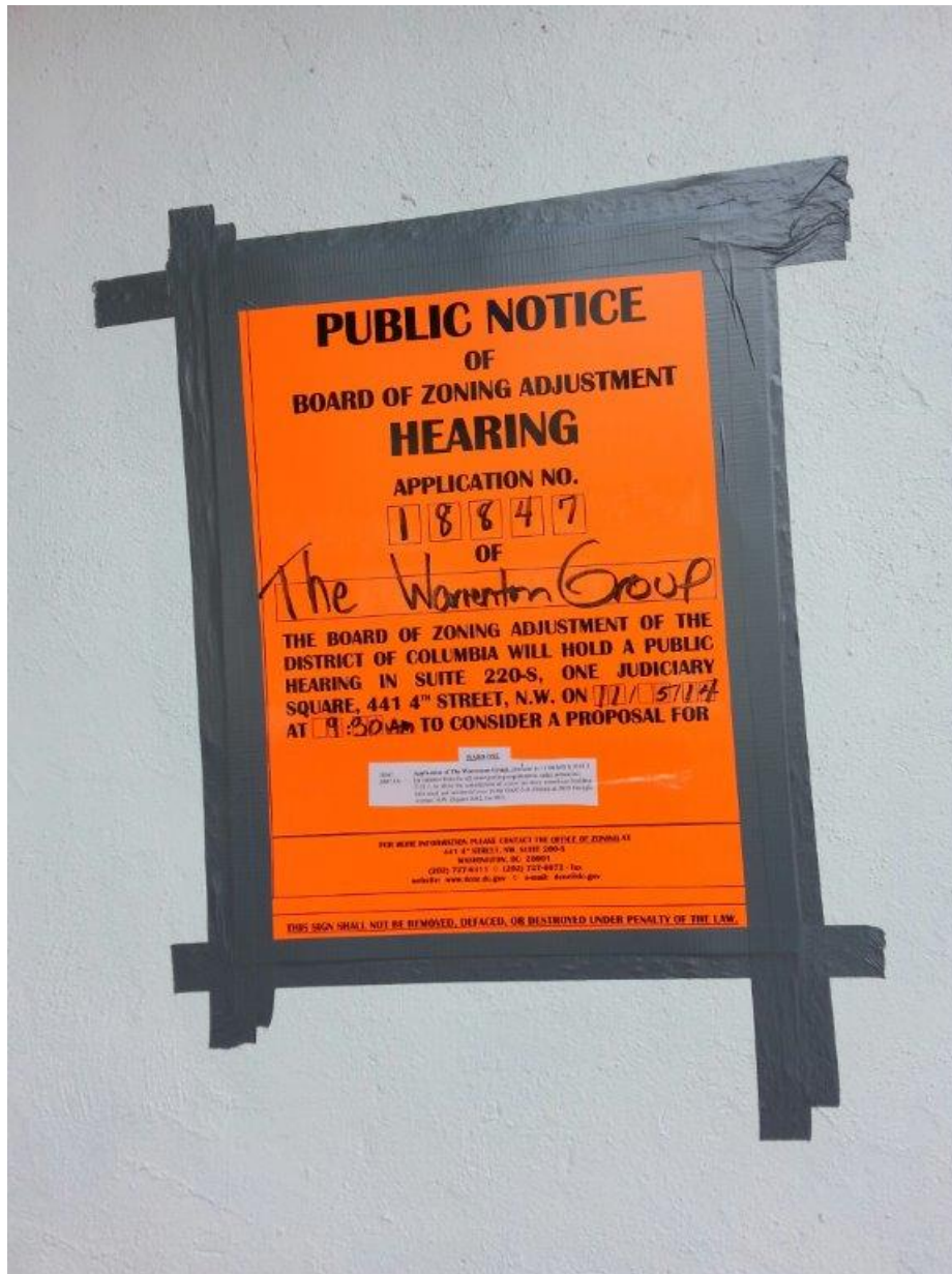
#4 BZA 18847 Princeton Place NW Posted 10-14-14 at 2:12 pm