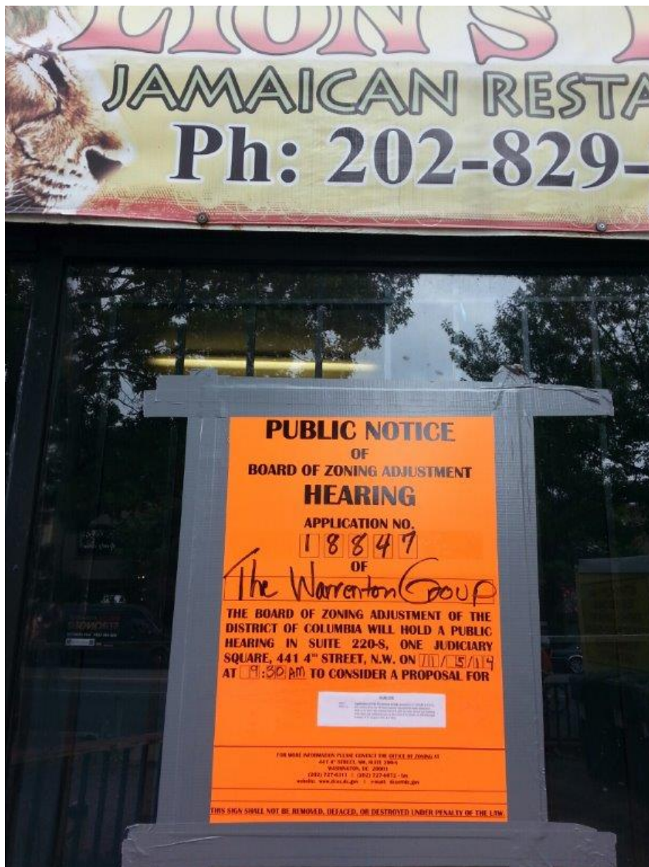
# 2 BZA 18847 3619 Georgia Ave NW Posted on 10-14-14 at 1:32 pm