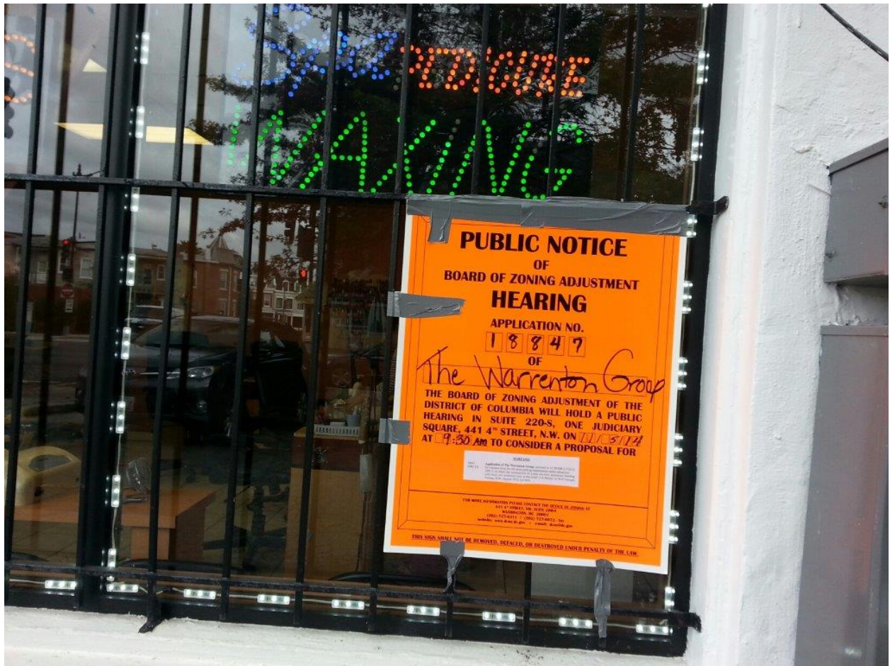
#3 BZA 18847 3619 Georgia Ave NW Posted 10-14-14 at 1:53 pm