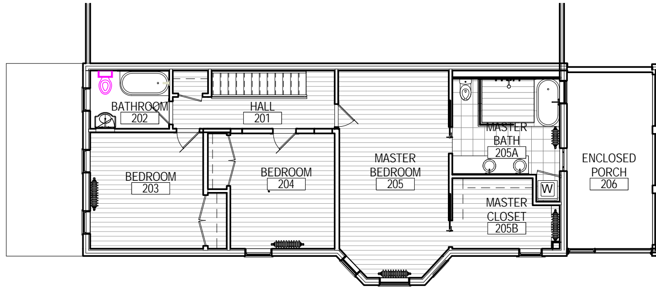
2 Z-2ND FLOOR PLAN 1" = 10'-0"