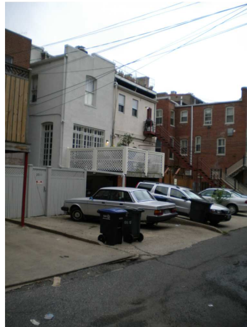
D. ALLEY-LOOKING SOUTH