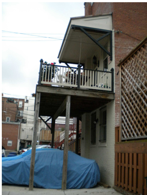
H. ALLEY-SOUTH EAST