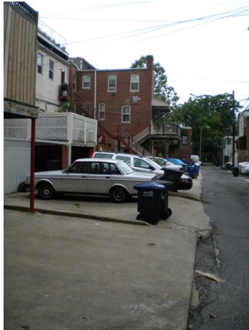
C. ALLEY-LOOKING EAST