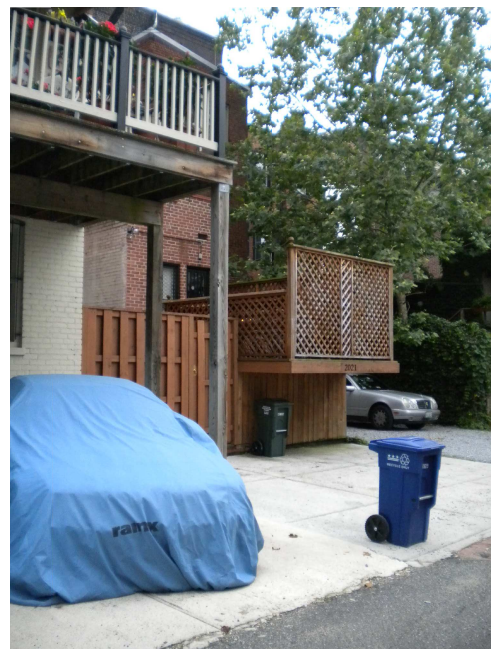
I. ALLEY-SOUTH WEST