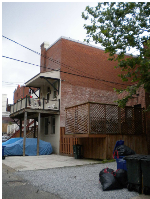
G. ALLEY-SOUTH EAST