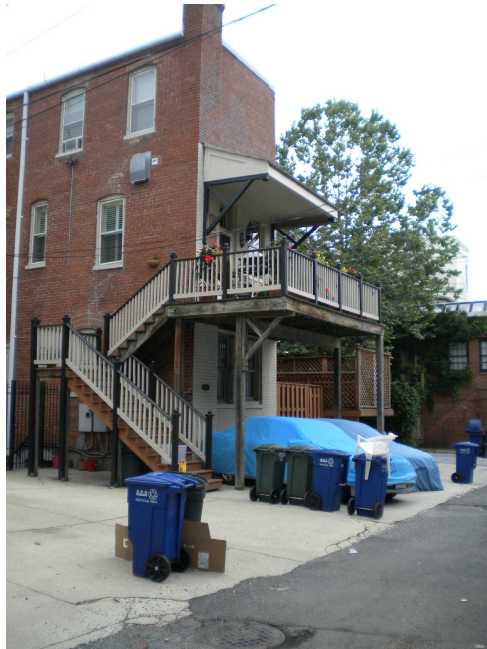
F. ALLEY-SOUTH WEST