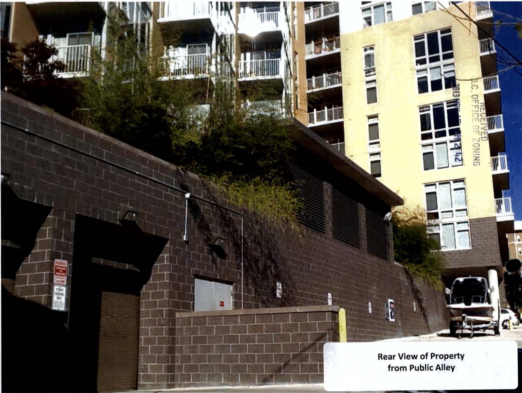
Rear View of Property from Public Alley