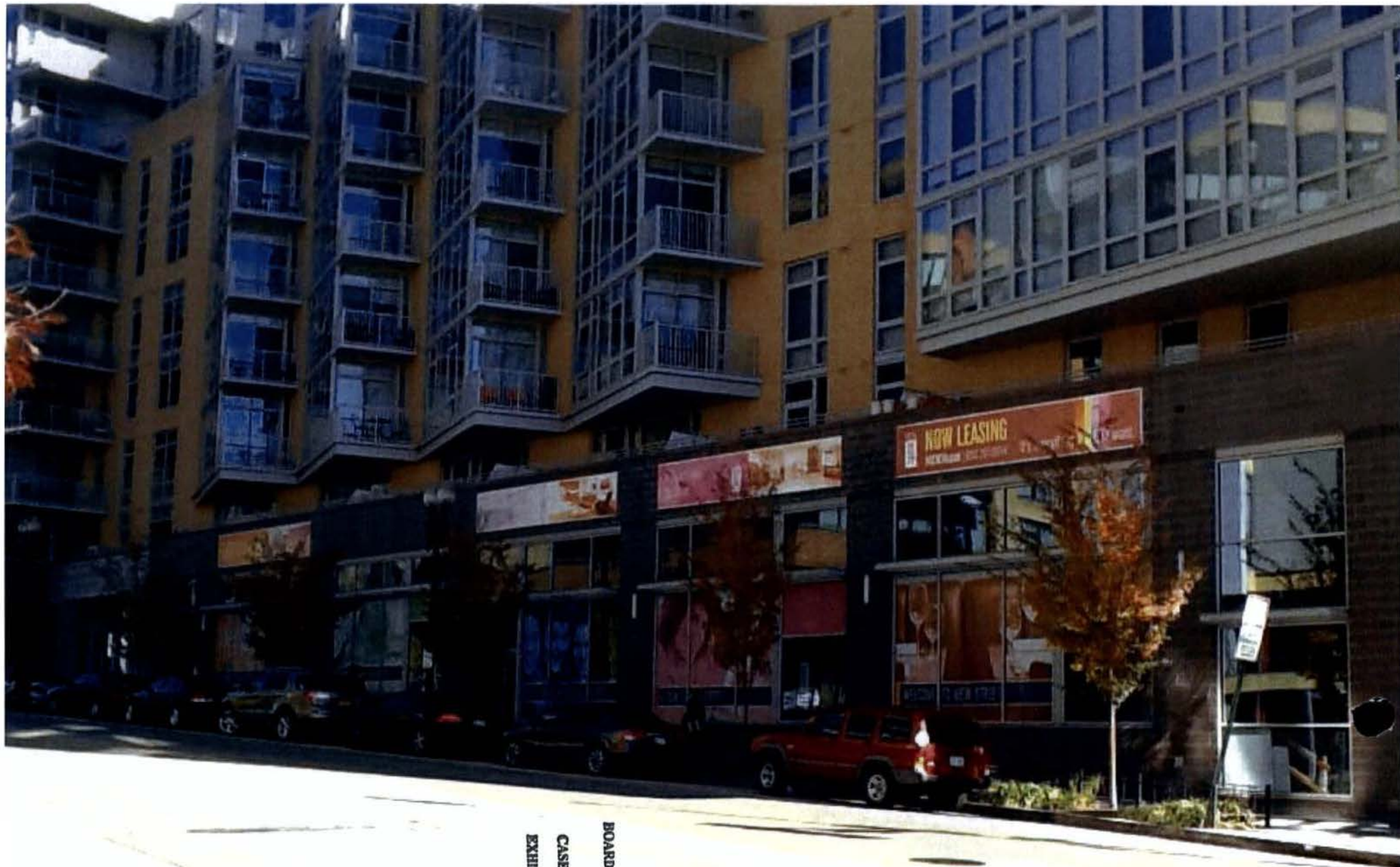
View of Property from the West side of 14 th Street, NW Board of Zoning Adjustment District of Columbia CASE NO. 18702 EXHIBIT NO. 8

BOARD OF ZONING ADJUSTMENT District of Columbia CASE NO. 18702 EXHIBIT NO. 8 RECEIVED D.C. OFFICE OF ZONING 2013 NOV 15 PM 2:45