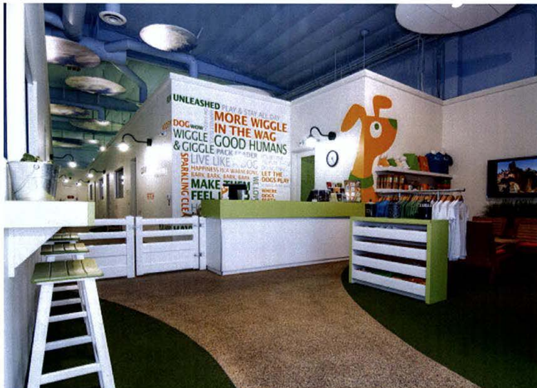
EXHIBIT NO. 36