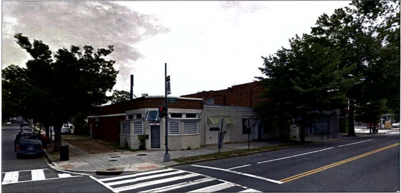
FACING THE PROPERTY FROM FLORIDA AVENUE