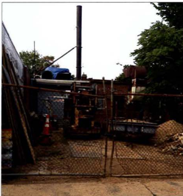
GRAVEL YARD AT REAR OF PROPERTY USED FOR VEHICLE STORAGE

RECEIVED D.C. OFFICE OF ZONING 2013 OCT 18 PM 12:56