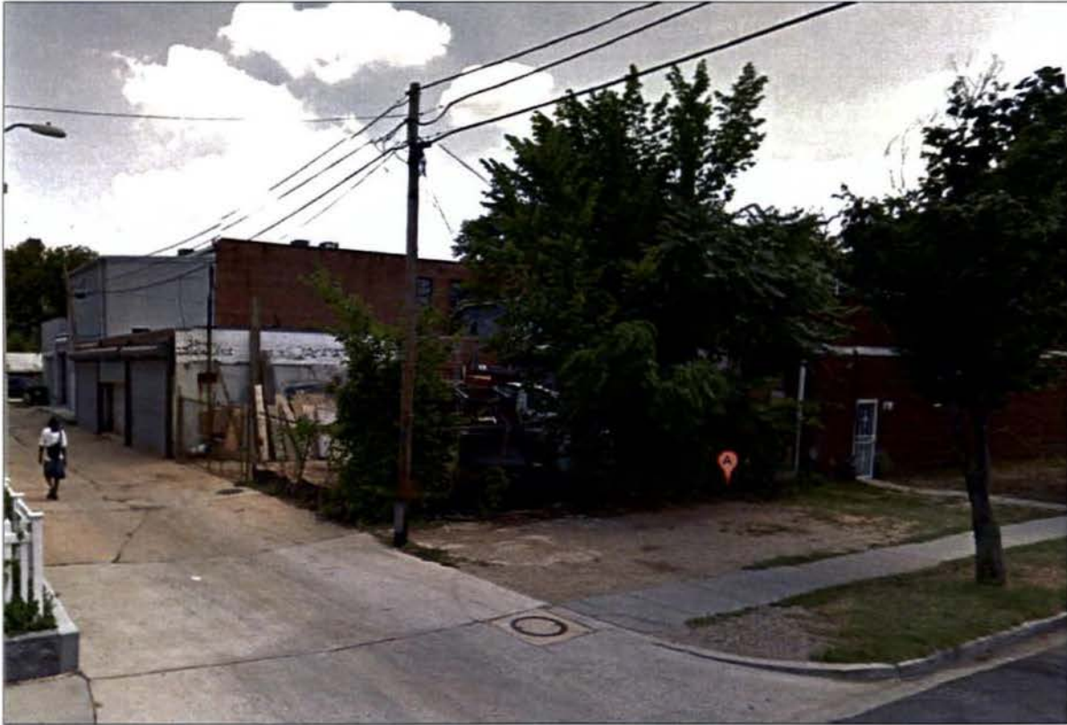
REAR ALLEY OFF ORREN STREET NE