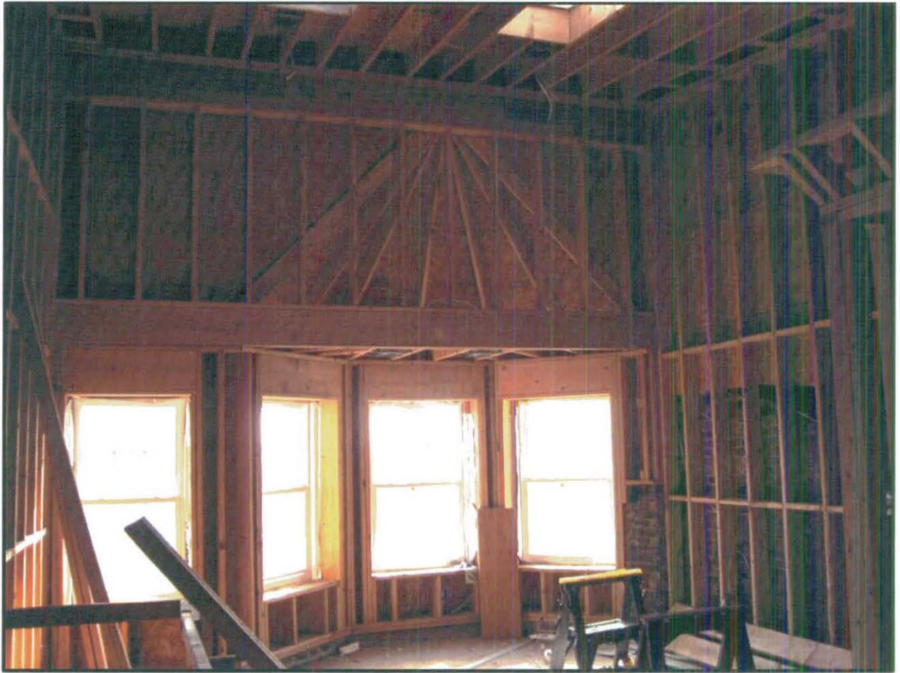
INTERIOR OF PROPERTY

RECEIVED D.C. OFFICE OF ZONING 2012 OCT 15 AM 11:38