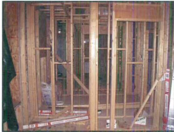
INTERIOR OF PROPERTY