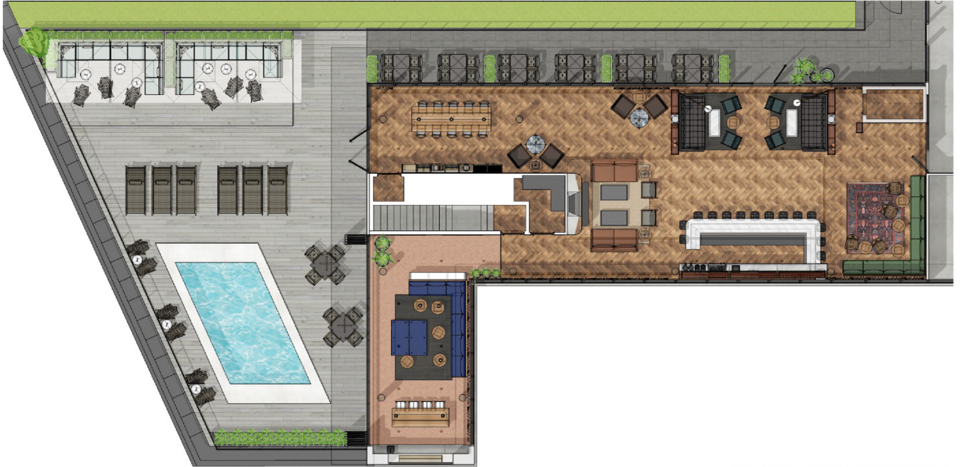
Conceptual Plan For Illustrative Purposes Only