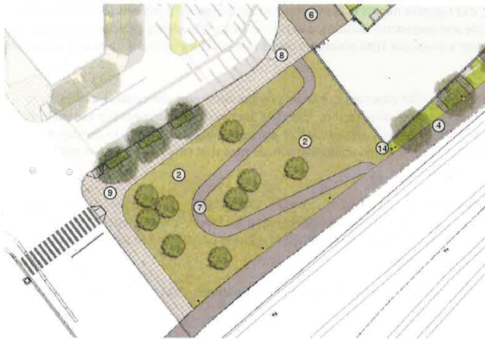
Figure 2 Temporary MBT Connection

The Applicant seeks flexibility to develop the project in phases with the North Building developing first. If developed in phases, a temporary bicycle connection between the MBT and Florida Avenue will be constructed on the site of the South Building until construction on that building begins (Figure 2). The width of the temporary connection is not specified. The connection should be at minimum of 8 feet wide to accommodate pedestrians and cyclists.